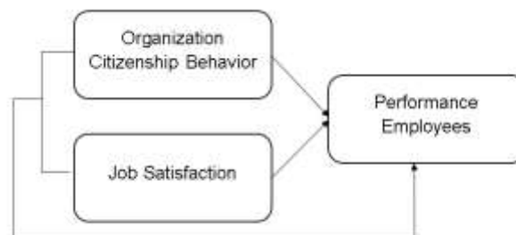
Figure 1. Research design

The research method used in the preparation of this thesis is field research. Field research is often applied to understand the institutions, culture, life experiences of communities, groups, and individuals in various aspects of life. This research adopts a quantitative approach, with the population set at employees at Juanda Airport. In this study, a sample of 22 employees was selected to represent the characteristics of the population. Data collection methods involved interviews and questionnaires, while data analysis was conducted using multiple linear regression analysis. This approach is expected to provide an in-depth understanding of the factors that influence the variables under study in the context of the work environment at Juanda Airport.